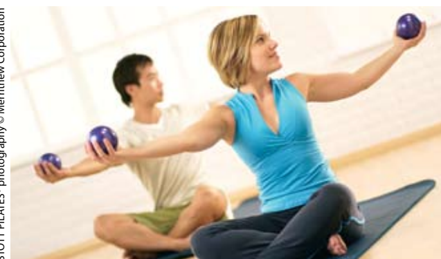
STOTT PILATES®

When time is tight, circuit training is the perfect solution. Moving quickly between sets keeps your heart rate up, allowing you to reap the benefits of cardiovascular training while working your muscles. Try a three-day routine rotating workouts for upper body, lower body and cardio.