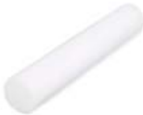
Foam Roller reg. $27.95 show special: $16