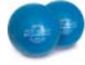
Weighted Hand-Grip Ball, 2lbs reg. $15.95 ea show special: $13 ea