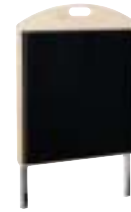
Large Jumpboard reg. $350 show special: $262