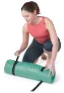
Pilates Express Mat reg. $49.95 show special: $37