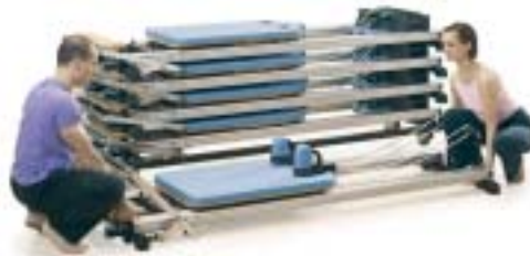
Rack & Roll Reformer reg. $3595 show special: $2696