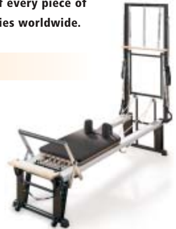
Rehab Reformer & Vertical Frame. reg. $6515 show special: $4886

Bonus: Purchase 5 Rack & Roll Reformers and receive a Rolling Storage Base and 5 Pro Reformer Boxes. save: $1850