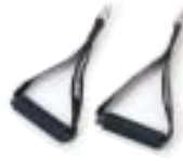
Foam Grip Handles reg. $46 pr show special: $34 pr