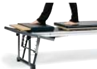
Padded Platform Extender reg. $180 show special: $135