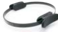
Fitness Circle® Lite reg. $44.95 show special: $33