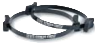
12" or 14" Fitness Circle® Pro reg. $69.95 ea show special: $52 ea