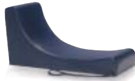
Spine Supporter reg. $214 show special: $159