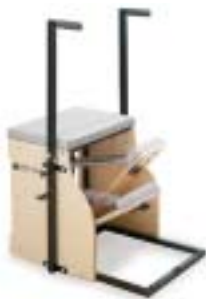
Split-Pedal Stability Chair reg. $1640 show special: $1230

Bonus: Receive a free Mat Converter when ordered by Aug 3 '04. value of: $345