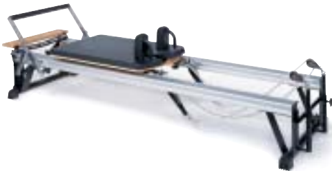
Professional Reformer reg. $4395 show special: $3296

Save 25% on Demo Equipment and Accessories: *