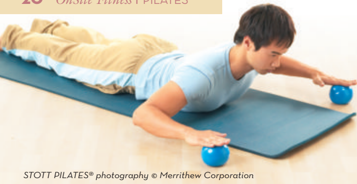
STOTT PILATES®

Keeping in mind that some popular Pilates exercises can put strain on the lower back of people with typical postural imbalances – there are numerous basic exercises that can be performed and/or modified on the Mat that can be helpful in addition to an already established athletic program.