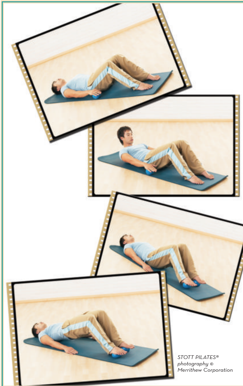
STOTT PILATES® photography © Merrithew Corporation

For more info on Pilates matwork, training for instructors, or Pilates for athletic conditioning, visit www.stotpilates.com