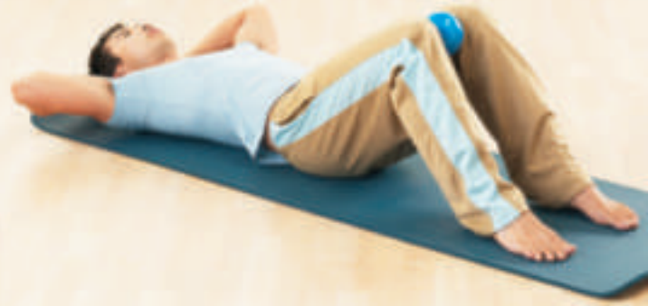
STOTT PILATES® photography © Merrithew Corporation

itself, and the world around it. It also focuses on good postural alignment which will help an individual perform a movement efficiently, thus reducing the amount of unnecessary strain on the muscles and joints.