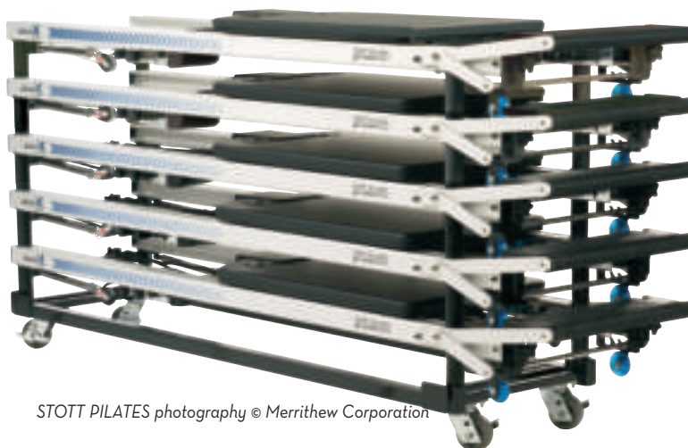
STOTT PILATES

PILATES ES: The Pilates Method Alliance (PMA) is a non-profit organization that provides the only nationally recognized certification exam for Pilates and has been doing so since 2005. While not all instructors that you have on site need to be certified, the PMA recommends that at least one certified instructor be on staff and