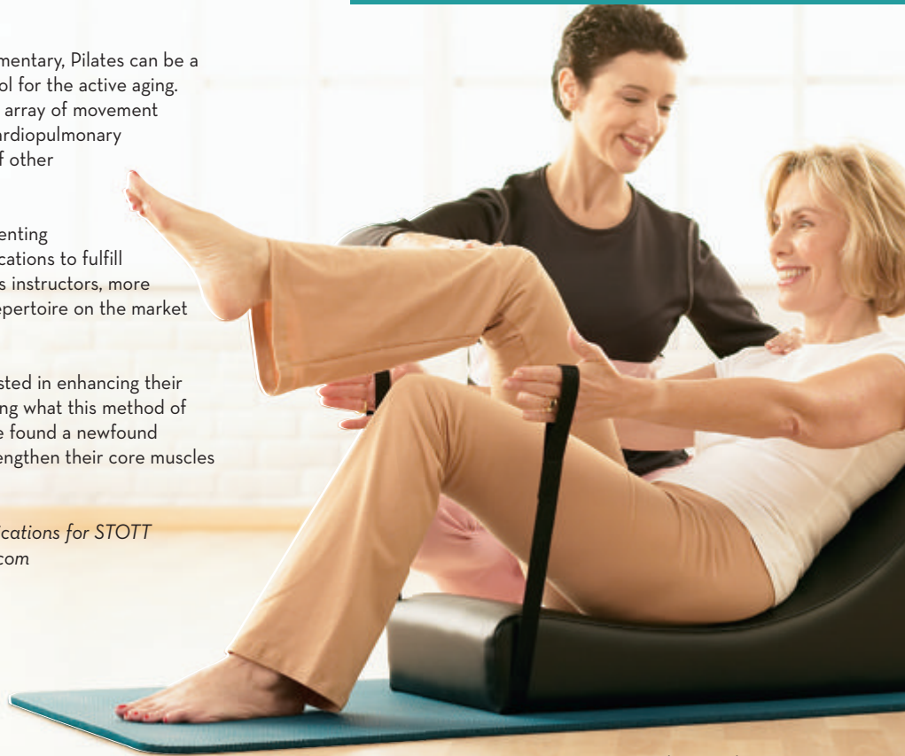
STOTT PILATES®